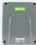
Logic Box (MGE) Mains Voltage version or (MGE-LV) Low Voltage version.