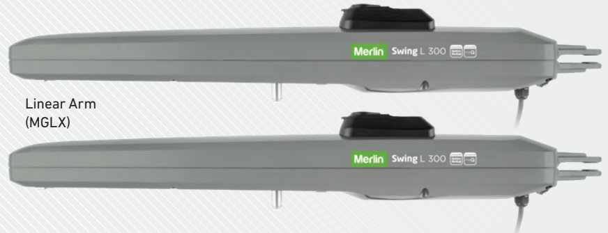
Linear Arm (MGLX)