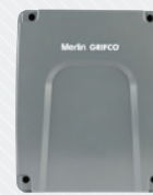
Transformer (MGTR3-120VA) only for Low Voltage Sales Kit (MGLDK-LV)